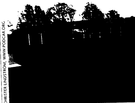
Innovative modes of mass transport powered by renewable energy would offer great benefits over advances like biofuels that perpetuate our reliance on energy-inefficient, gridlock-bound cars. Sweden, for instance, is testing a podcar system.

Can we move people more safely and efficiently? Yes, we can. By using grade separation to keep riders several feet above